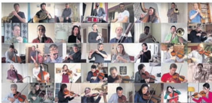
In this handout photo provided by the National Orchestra of France on Wednesday April 1, 2020, musicians from the National Orchestra of France are shown in the screenshot as a patchwork, each performing parts of "Bolero" alone in lockdown. The musicians recorded themselves over several days in March for this video posted by the orchestra on March 29. With the magic of technology, their individual videos were woven together to create a rousing orchestra-like sound for the famous piece of music by French composer Maurice Ravel.

Like building a musical jigsaw puzzle, the National Orchestra of France used the magic of technology